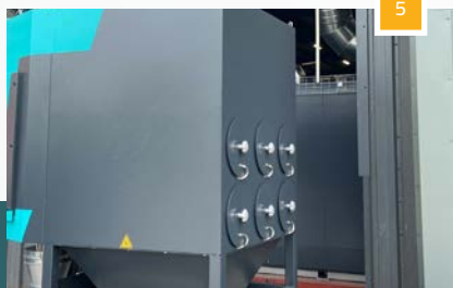
Clean working environment