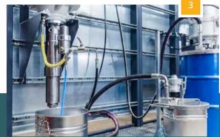
Specific paint supply systems for each type of paint