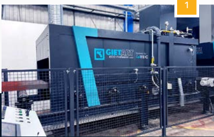
Improved coating quality, shorter drying times