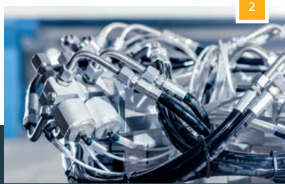
Optimal painting results