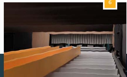
Energy efficient drying tunnel